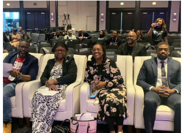
Oratorical Competition Judges for ISSA at 83rd iCongress