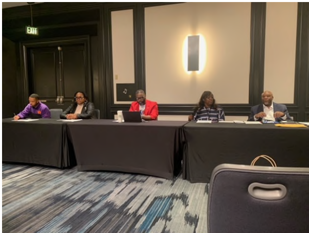
A generational panel “Bridging the Gap”