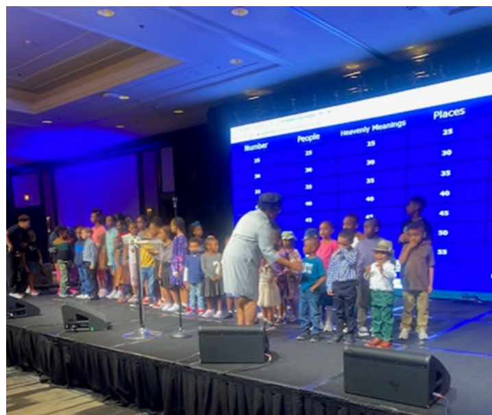
Kingdom Kids preparing to render a melody of songs in English and Spanish at the ISSA Bible Bowl Competition